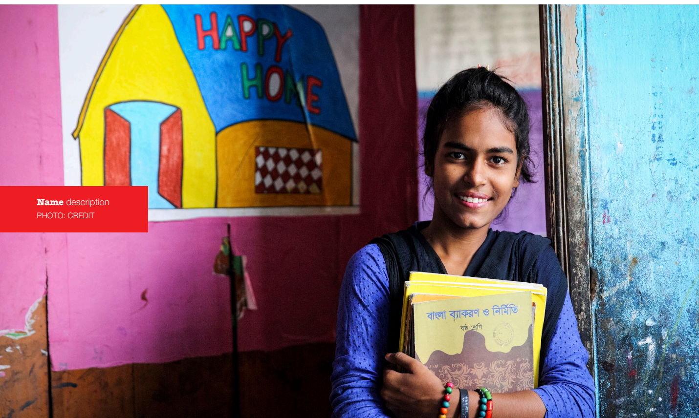
Name description PHOTO: CREDIT