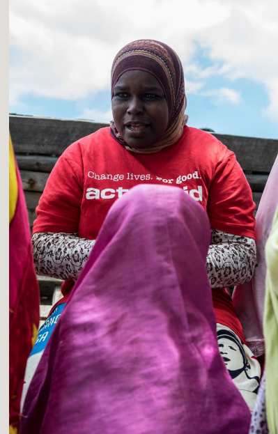
Name description PHOTO: CREDIT

Climate change impacts heavily on the livelihoods of people living in poverty and exclusion, particularly women. We will pursue climate justice by holding wealthy countries responsible for the climate crisis and accountable for compensating affected countries for loss and damage, as well as supporting communities to adapt to climate change. ActionAid understands the interconnectedness of all natural resources as critical to ensuring resilient livelihoods for all of humanity and for ecology. ActionAid will work with communities to build resilient livelihoods in rural and urban areas. In strengthening food sovereignty, we will continue to advocate for fairer redistribution of land and other productive resources, with an emphasis on increased access and control for women, indigenous peoples, young people and other excluded groups, while challenging grabbing of such resources. We will promote agro-ecology as climate resilient sustainable agriculture is a means of strengthening food systems and the capacity of smallholder farmers to adapt to climate change. During the first three years of this strategy we will build a collective knowledge base on urban livelihoods with the objective of growing work in this area in the years to come.