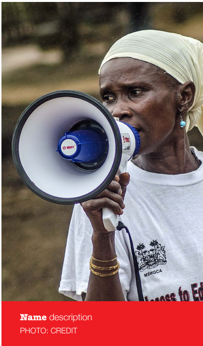
Name description PHOTO: CREDIT