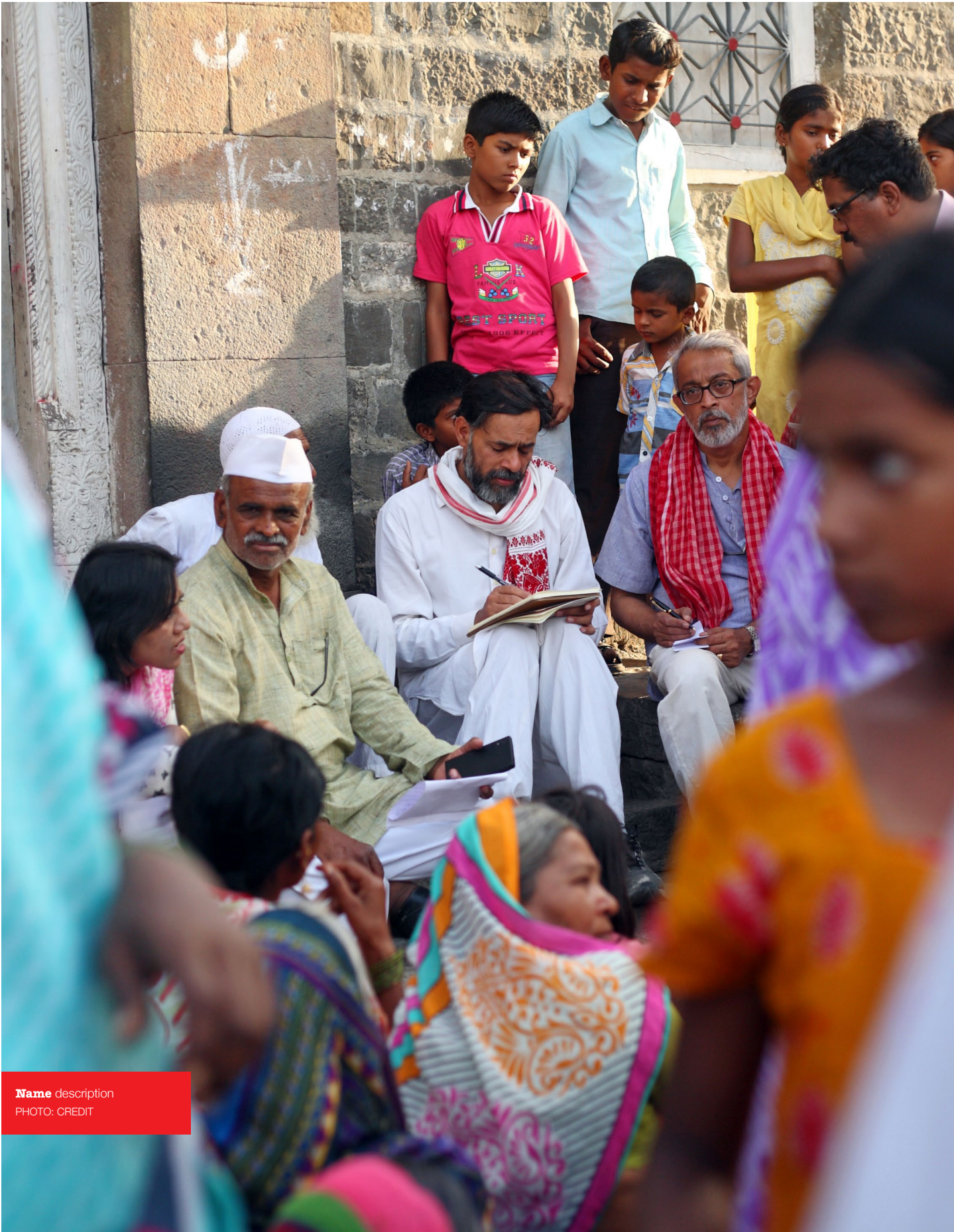
Name description PHOTO: CREDIT