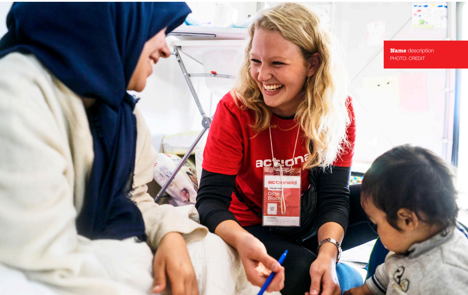
Name description PHOTO: CREDIT

Around the world, ActionAid is rooted in the contexts where we operate and proudly upholds our primary accountability to the people most affected by unequal power relations.