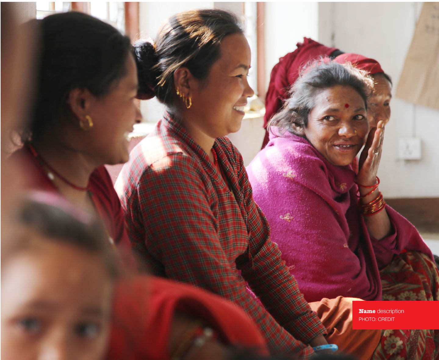
Name description PHOTO: CREDIT