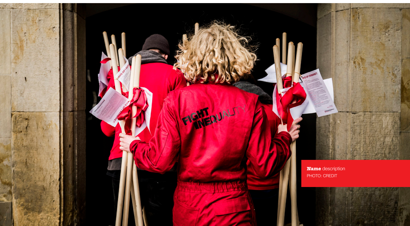
Name description

ActionAid will be responsive and adaptive to the external environment. While we cannot predict the level of change and its impact on our funding over the next ten years, we know that political and economic shifts are happening faster than ever. We also know that fundraising costs are increasing, donors are establishing stronger regulatory frameworks, and the way in which official aid is being defined and delivered is changing rapidly. Despite these challenges, opportunities for alternatives are emerging. Supporters from middle income economies are beginning to give regularly. Institutional donors have committed to ensuring greater levels of funding flow directly to local and national organisations, leading to greater opportunities at country-level for resourcing our programme priorities. Philanthropic giving continues to grow across a number of countries where ActionAid has a presence with donors becoming increasingly engaged and involved in their giving.