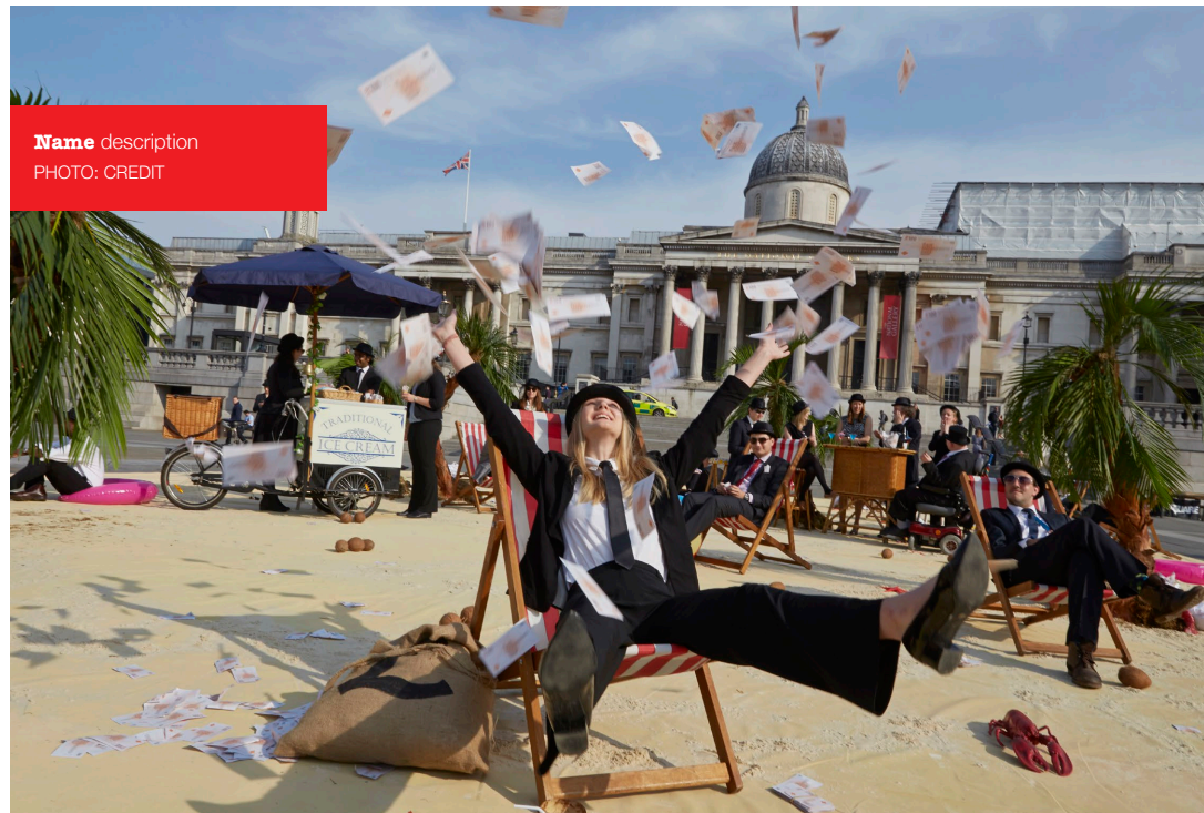
Name description PHOTO: CREDIT