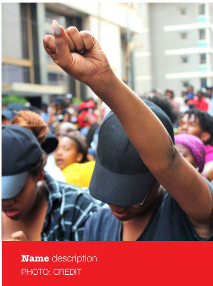
Name description PHOTO: CREDIT

Social movements are beginning to unite at all levels to challenge inequitable growth, create space and momentum to define sustainable alternatives to the status quo. Advocacy and campaigning by global and national coalitions has also brought increasing public attention to the world's tax havens, widespread tax evasion, aggressive tax avoidance regimes and illicit financial flows. The emergence of different forms of South-to-South cooperation is also contributing to redress unequal power relations between wealthy and lower income countries.