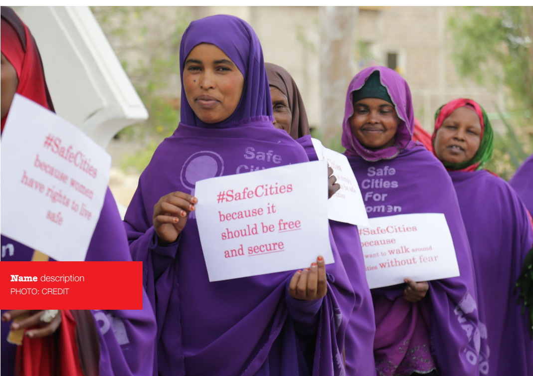
Name description PHOTO: CREDIT

All of these global trends call on us to rethink where, how and with whom we work, and the unique contribution ActionAid can make as a global federation working within and across countries. It is clear that greater connectedness of the daily struggles of people living in poverty and exclusion, and with broader alliances, coalitions and movements are urgently needed to bring systemic change in people's lives and to shift unequal power structures at a global scale. Over the next decade, as we work to progress Strategy 2028 , ActionAid will harness its collective power as a global federation by connecting struggles wherever we work, creating global momentum for social, economic and environmental justice, and supporting people living in poverty and exclusion in driving this change.