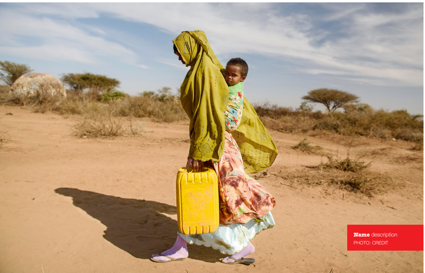
Name description

Today, there are 350 million fewer people living in poverty worldwide than in the year 2000. The Sustainable Development Goals (SDGs), adopted in 2015, have set out a road map to 2030 to guide international efforts to end poverty, protect the planet and ensure prosperity for all. At the same time, the UN estimates 2 that climate change is expected to drive 122 million more people into poverty by 2030 and exacerbate existing poverty. Inequalities are also preventing millions of people from enjoying a life with dignity. We live in a moment of global transition where dominant economic forces are affecting the lives of the people with whom we work. In many countries, this has resulted in increased deregulation, privatisation of public services, the dismantling of social protection, a declining role of the state as well as an undermining of democratic institutions. This is contributing to unprecedented economic crises, environmental degradation, and increasing inequalities of power and wealth. There is emerging momentum and aspiration around the globe to transform towards a more equitable, socially and environmentally sustainable world. The time has come to reimagine a different pathway for humanity.