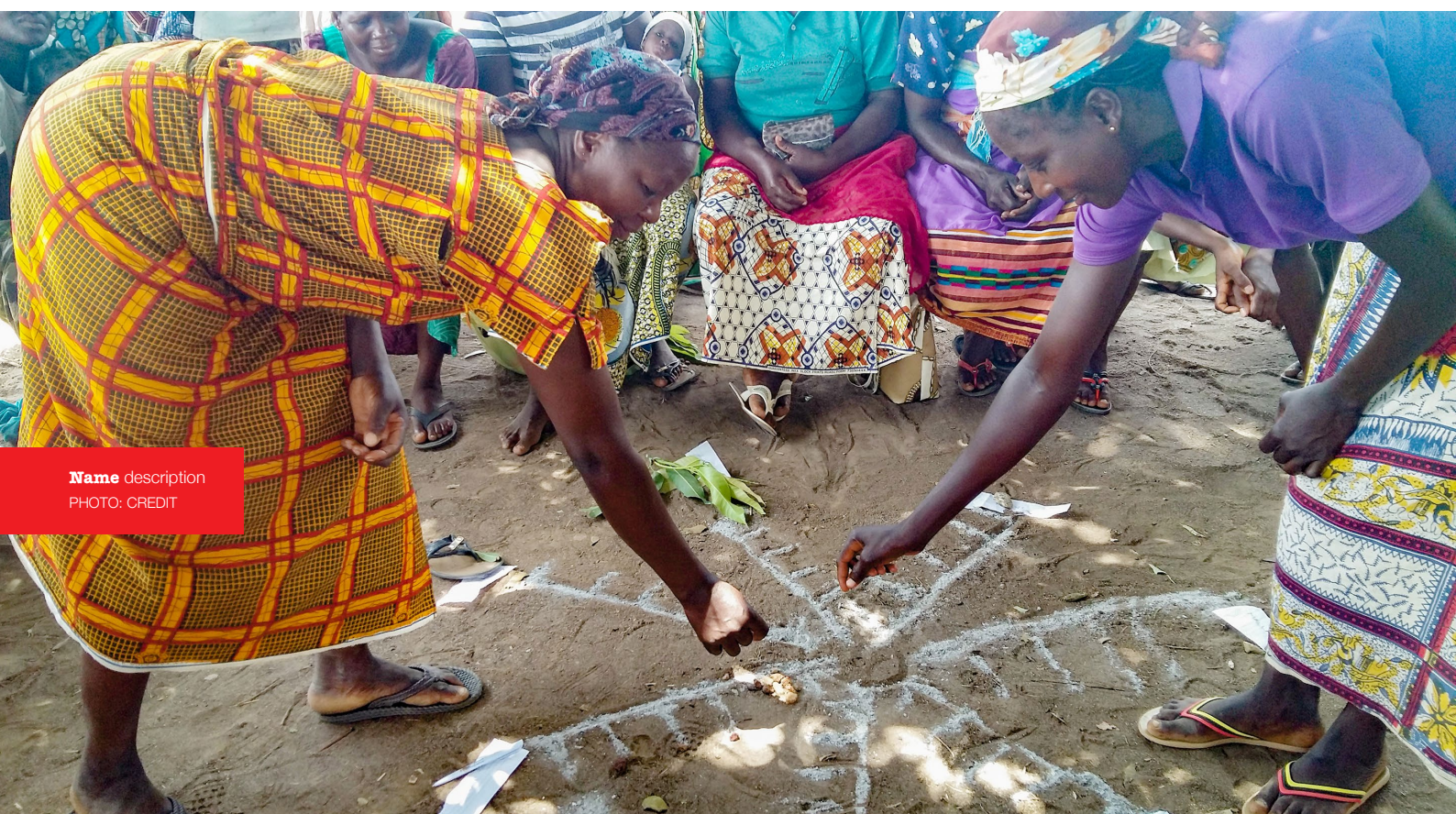
Name description PHOTO: CREDIT