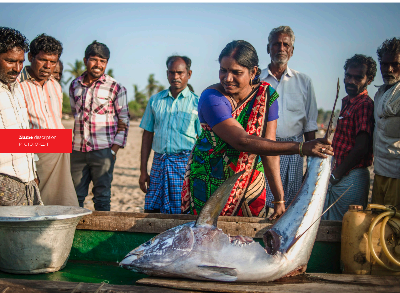
Name description PHOTO: CREDIT

We will take a learning approach to our work, which is grounded in developing knowledge from below, and specifically from the experiences of communities and allies we work with, in collaboration with centres of learning, to deepen our understanding of how change happens. We will share community-generated knowledge and alternatives with social movements, policy makers and other practitioners in order to transform policy and practice. We will propose alternatives to the systems and practises we criticise, and ensure that the people we work with are central in defining and building these solutions.