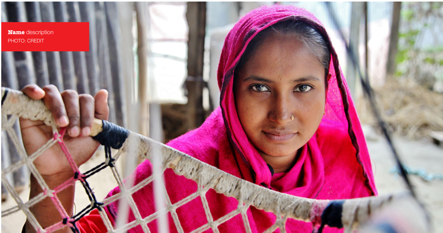
Name description PHOTO: CREDIT