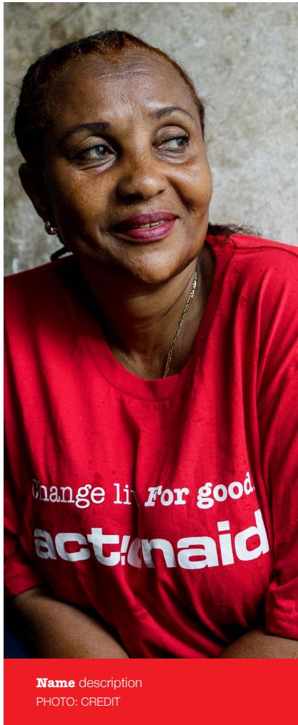
Name description PHOTO: CREDIT