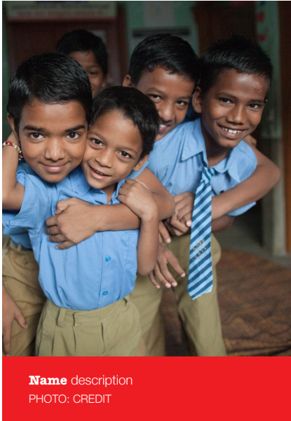
Name description