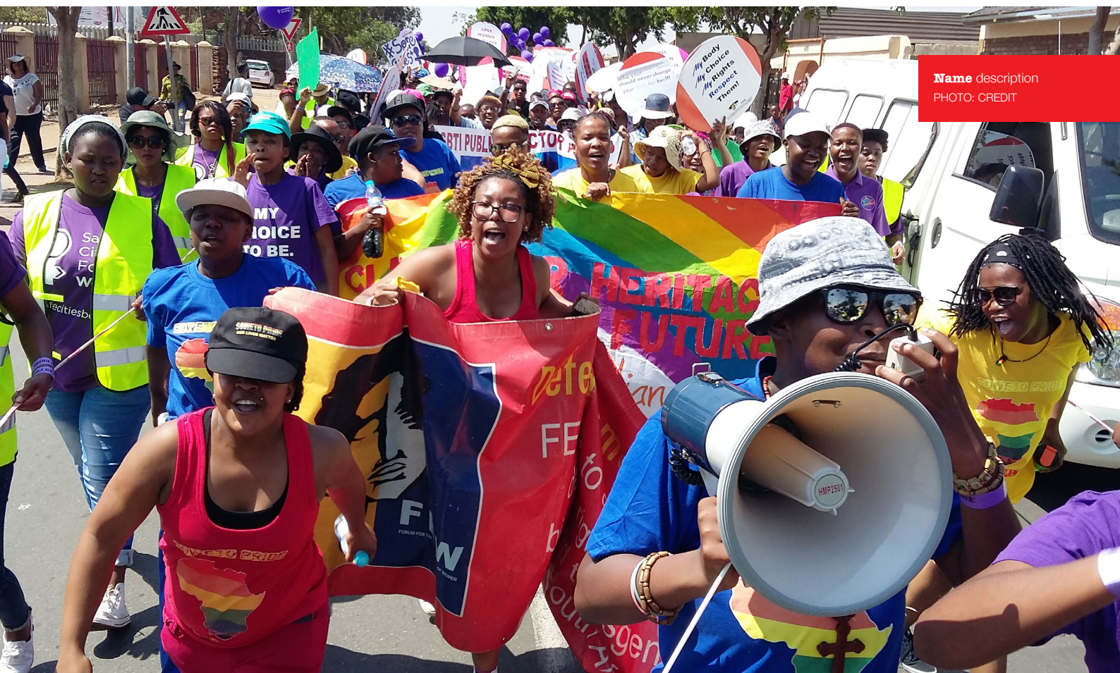
Name description PHOTO: CREDIT

The state, as an important guarantor of human rights, must be democratic and held accountable for its primary duty to protect rights and deliver justice. This will only happen if the space to influence the state is created and expanded through sustained people’s struggles, bolstered by global solidarity. To realise universally accepted rights and achieve dignity, it is essential that the individual and collective agency of people living in poverty and exclusion is mobilised to claim rights and resist all forms of discrimination. Public awareness and action to reveal and confront hidden forms of power, such as corporate power, is also essential to achieving social justice. The realisation of women’s rights can be transformative globally, and as a result, women’s movements, civil society organisations and other self-mobilised groups should be resourced and strengthened to challenge negative social and cultural norms and practices which fuel discrimination and violation of rights.