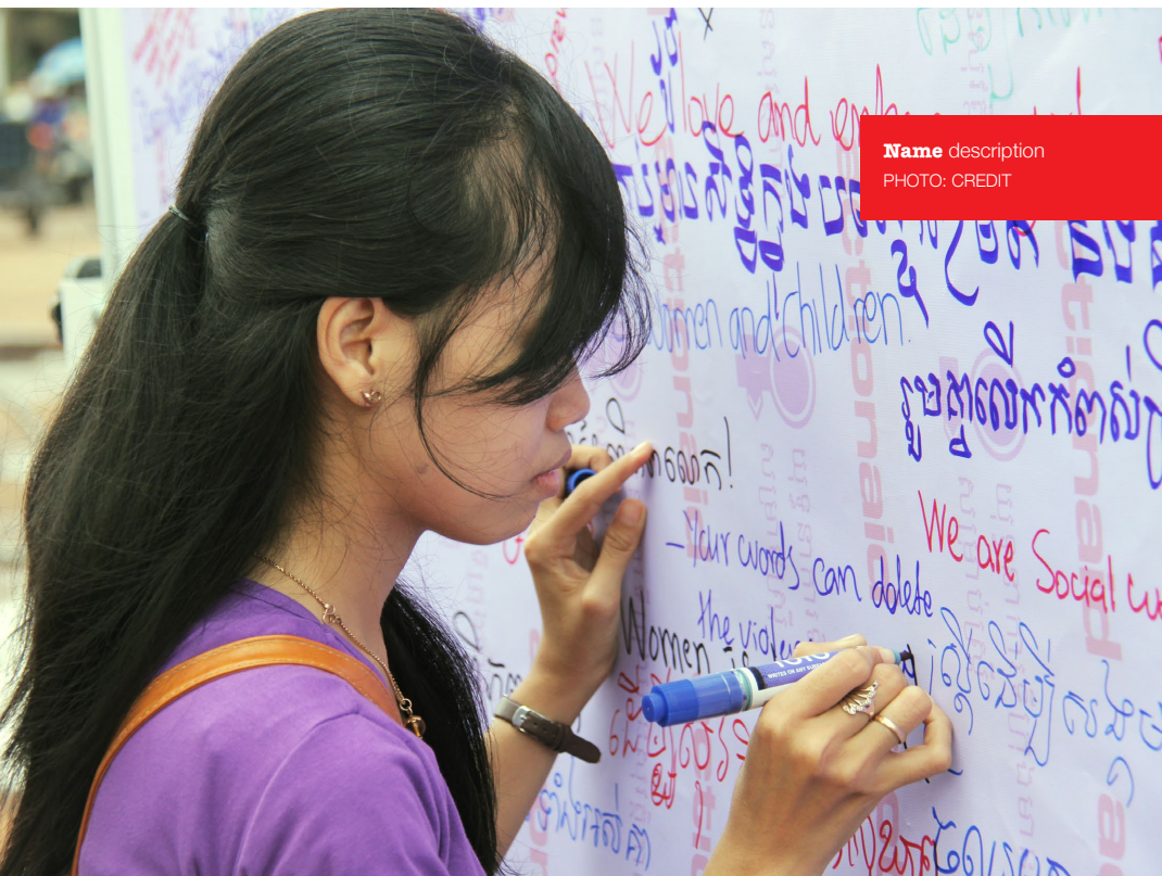
Name description PHOTO: CREDIT